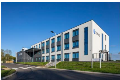
Video Tour of WBCA

Click on the images below for a video tour of West Bromwich Collegiate Academy and to hear about the experiences of some of our current students.