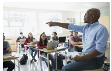
Induction Day Activities