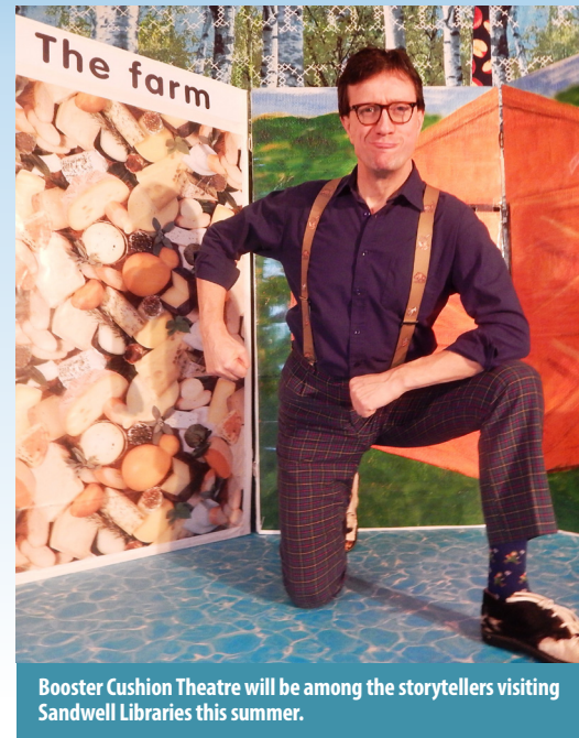
Booster Cushion Theatre will be among the storytellers visiting Sandwell Libraries this summer.

Contact your local library for their full programme – find out more at www.sandwell.gov.uk/librariesonline and www.visitsandwell.com and search 'Sandwell Libraries' on Twitter (@sandwelllibs) or search 'SandwellLibraries' on Facebook.